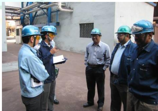
Steel Task Force Experts visit Indian Steel Plant, February 2009.

Under Project STF-06-04, Performance Diagnosis , Japanese APP experts in energy savings and environmental protection conducted site visits of Indian steel plants in February 2009, to offer advice on best practices and clean technologies. APP Task Force Partners will use the performance diagnoses to develop improvement plans (increasing energy efficiency and environmental protection opportunities), and identify opportunities for collaborative research and development. The Japanese steel industry experts participating in this effort visited Jamshedpur Works of Tata Steel Limited and Visakhapatnam Steel Plant of Rashtriya Ispat Nigam Limited (RINL).