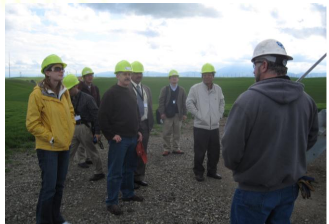
Task Force participants of the Wind Generation wind generation technical information exchange program.

The Power Generation and Transmission Task Force held a wind generation technical information exchange program in San Francisco, California, USA from 2-6 March 2009. The event, the latest in the series of Task Force utility peer review exchanges, was attended by 29 participants from APP Partner countries, including representatives from utility companies, wind energy industry associations, state electricity regulators, academia, and federal and provincial governments. Participants engaged in technical discussions on issues such as transmission planning, wind resource assessment, grid interconnection, RD&D efforts, system balancing methods, and wind generation best practices.