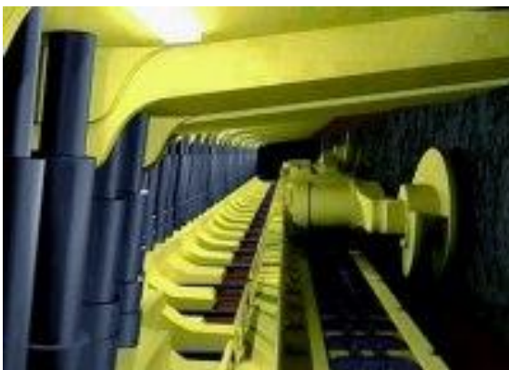
Automated longwall coal mining equipment

This report, Coal Mining Workforce Safety Skills, Training and Education , is a deliverable of the Task Force project CLM-06-09, Coal Mine Health and Safety , and will ultimately be made available on the APP website. The Task Force project seeks to develop a strategic approach toward risk management; advance the goal of zero fatalities and injuries in the coal mining industry in Partner countries; and identify leading practices to control health and safety risks in the mining sector.