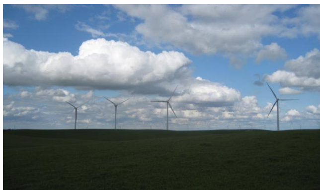
NextEra Energy wind farm, Solano County, CA, USA.

The event included a visit to a wind farm owned by NextEra Energy which generates 162MW of wind power through 90 turbines.