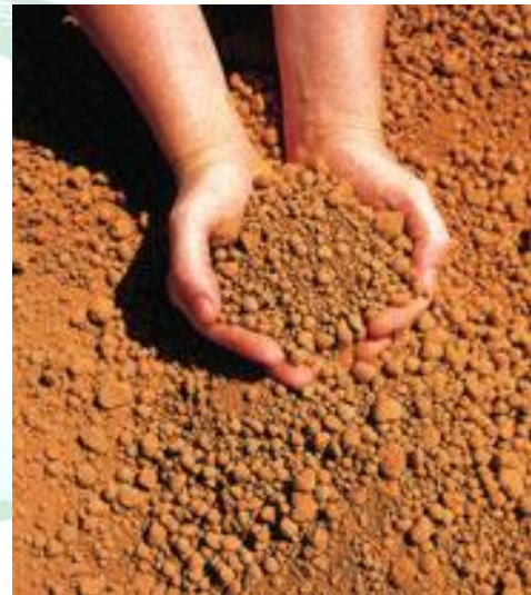
Aluminium bauxite

bauxite. Around 70 million tons of bauxite residue created each year is currently being disposed of in land-based storage areas. APP Partners are working to increase the amount of alumina recovered by reprocessing, and recover and subsequently reuse chemicals required for processing. Partners also hope to produce commercially and economically viable products from residue in order to defray the environmental impact and overall costs of the currently used processes.