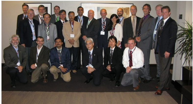
Participants of the Wind Electric Generation Event, 13-15 September 2010 in Montreal, Canada.

For more information on the Power Generation and Transmission Task Force, please visit: http://www.asiapacificpartnership.org/tf_powergeneration_transmission.aspx .