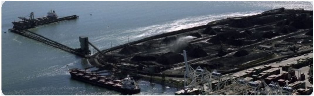
Westshore Terminals located at Roberts Bank, Delta, Canada.

Meeting participants also took part in a site visit to the Westshore Terminals located at Roberts Bank, Delta, British Columbia. This terminal is one of Canada's largest coal export facilities. For the past decade, Westshore has also been the busiest single export coal terminal in all of North America, routinely shipping about 21 million tons of coal each year. U.S. shipments reached a record of two million tons in 2009. Created from dredging the Strait of Georgia in one of the largest reclamation projects of its kind, the terminal has been a consistent and major source of revenue for Canada and British Columbia. During its 40 year history Westshore has completed three major expansions or upgrades, leading to their current capacity of 29 million tons per year.