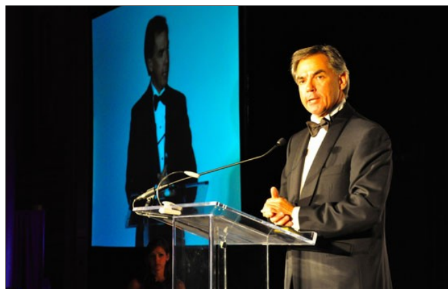
Minister Prentice receiving the International Star (I-Star) of Energy Efficiency Award, September 2010 in Washington, DC.

For more information on the activities of the Buildings and Appliances Task Force, please visit: http://www.asiapacificpartnership.org/english/tf_buildings_appliances.aspx .