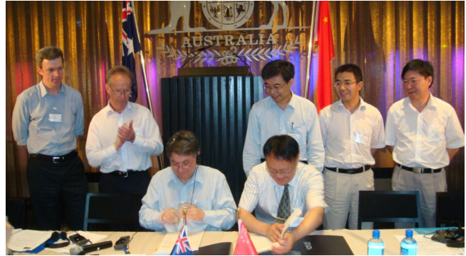
Cleaner Fossil Energy Task Force members signed an agreement on 7 July 2010 to launch the demonstration phase of project CFE-06-13, CO 2 Enhanced Coal Bed Methane .

Please visit the Cleaner Fossil Energy Task Force page at: http://www.asiapacificpartnership.org/english/tf_fossil_energy.aspx .